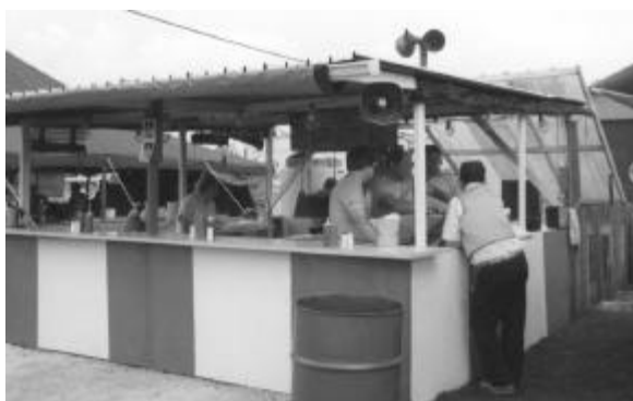
Our Famous "Munchie Booth"