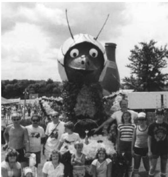
1983 Sussex Lions Daze Float

In September 1983 the Club started looking into having a booth at Lions Daze, selling either chicken wings, baked potatoes or wine coolers. We were denied a booth for no apparent reason. But in April of 1984 the Lions' reconsidered and called to give the Sled Bugs permission to have a booth in 1984 Lions Daze, but we could not sell food or booze. Many suggestions were offered, the decision was made to sell T-shirts. A small booth was built and ready by July.