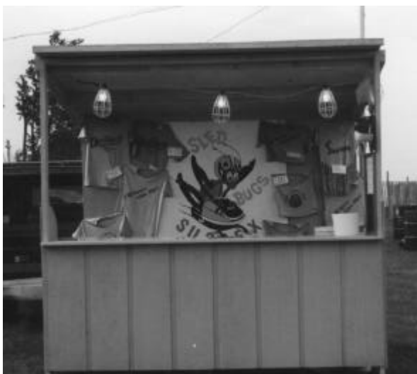
1984 Sussex Lions Daze T-Shirt Booth

In September 1983 the Club started looking into having a booth at Lions Daze, selling either chicken wings, baked potatoes or wine coolers. We were denied a booth for no apparent reason. But in April of 1984 the Lions' reconsidered and called to give the Sled Bugs permission to have a booth in 1984 Lions Daze, but we could not sell food or booze. Many suggestions were offered, the decision was made to sell T-shirts. A small booth was built and ready by July.