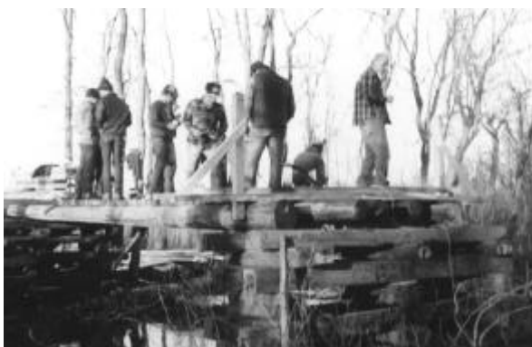
Building the Bark River Bridge in 1984